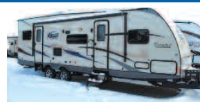
2014 FREEDOM EXPRESS 26' TRAVEL TRAILER MODEL 230 BH Light weight trailer perfect for a smaller tow vehicle. MSRP $26,979.75. SALE PRICE $17,995.

If you are attending an RV show anywhere in Michigan this winter or spring, stop in with any "show deal" and we will meet or beat any price. No need to drive hundreds of miles to pick up your RV, or worse, drive hundreds of miles and take days off of work for service. It is always best to stay local.