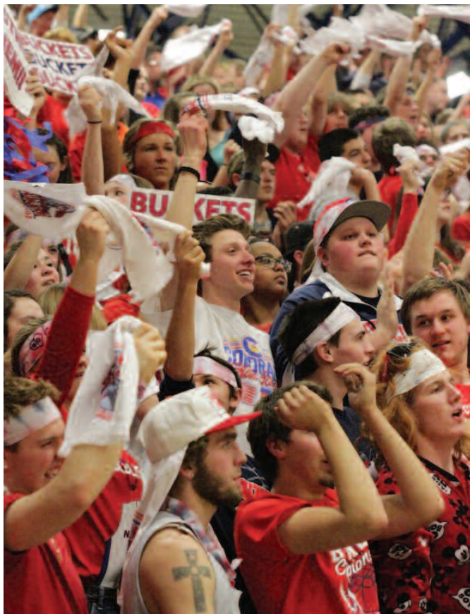
LEFT: Boyne City fans helped pack over half of the Gaylord High School Gym and helped motivate their Ramblers with their support.