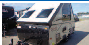
2015 COMET A-FRAME POP-UP CAMPER. Model 1232. Space saving, innovative design. MSRP $13,314. SALE PRICE $10,995.