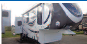
2014 BIGHORN FIFTH WHEEL MODEL 3010 RE Triple slide-out, well insulated for all season camping. MSRP $75,668. SALE PRICE $49,995.