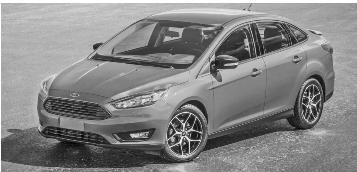
The new 2015 Focus offers a bold exterior design, an intuitive and upscale interior, a host of technologies uncommon for a compact car and the option of Ford's award-winning 1.0-liter EcoBoost® engine.