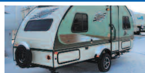
2015 R-POD 20' TRAVEL TRAILER, MODEL 178 Slide-out MSRP $20,270.75 SALE PRICE $14,995.